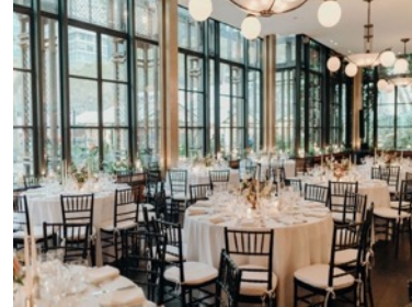
grill dining room

You can design your ceremony and reception to fit your needs. Depending on the season, the space can accommodate up to 220 people.