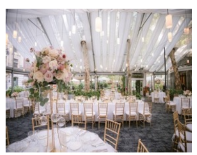
the south garden