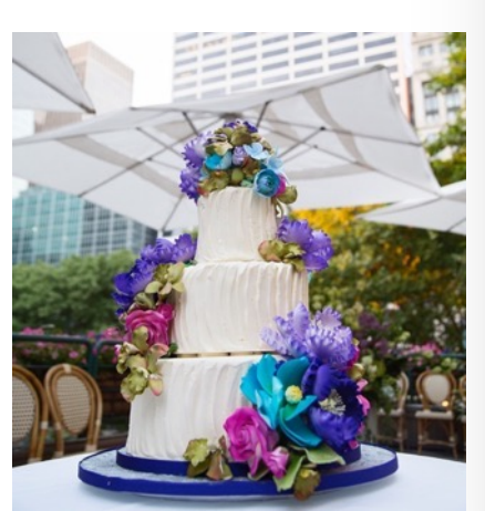
BRYANT PARK grill